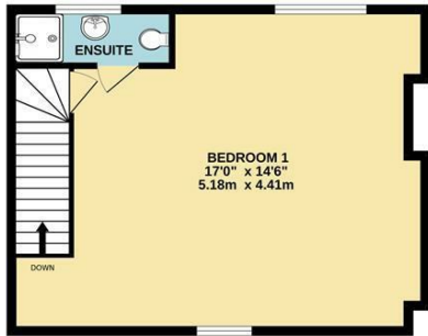
TOTAL FLOOR AREA : 2010 sq.ft. (186.7 sq.m.) approx.

Whilst every attempt has been made to ensure the accuracy of the floorplan contained here, measurements of doors, windows, rooms and any other items are approximate and no responsibility is taken for any error, omission or mis-statement. This plan is for illustrative purposes only and should be used as such by any prospective purchaser. The services, systems and appliances shown have not been tested and no guarantee as to their operability or efficiency can be given. Made with Metropix ©2023